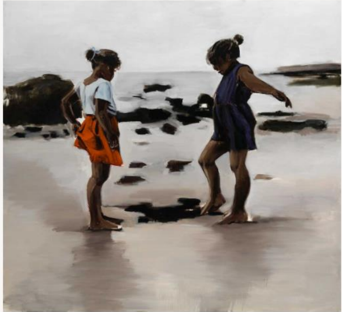
Lynette Yiadom-Boakye Condor And The Mole , 2011

HER FAVOURITE PAINT TO USE IS OIL PAINT. OIL PAINT IS A TRADITIONAL PAINT THAT TAKES A LONG TIME TO DRY. SHE SAYS: "IT'S JUST VERY DIRTY, IT'S VERY MESSY; IT DOESN'T ALWAYS DO WHAT YOU WANT IT TO DO."