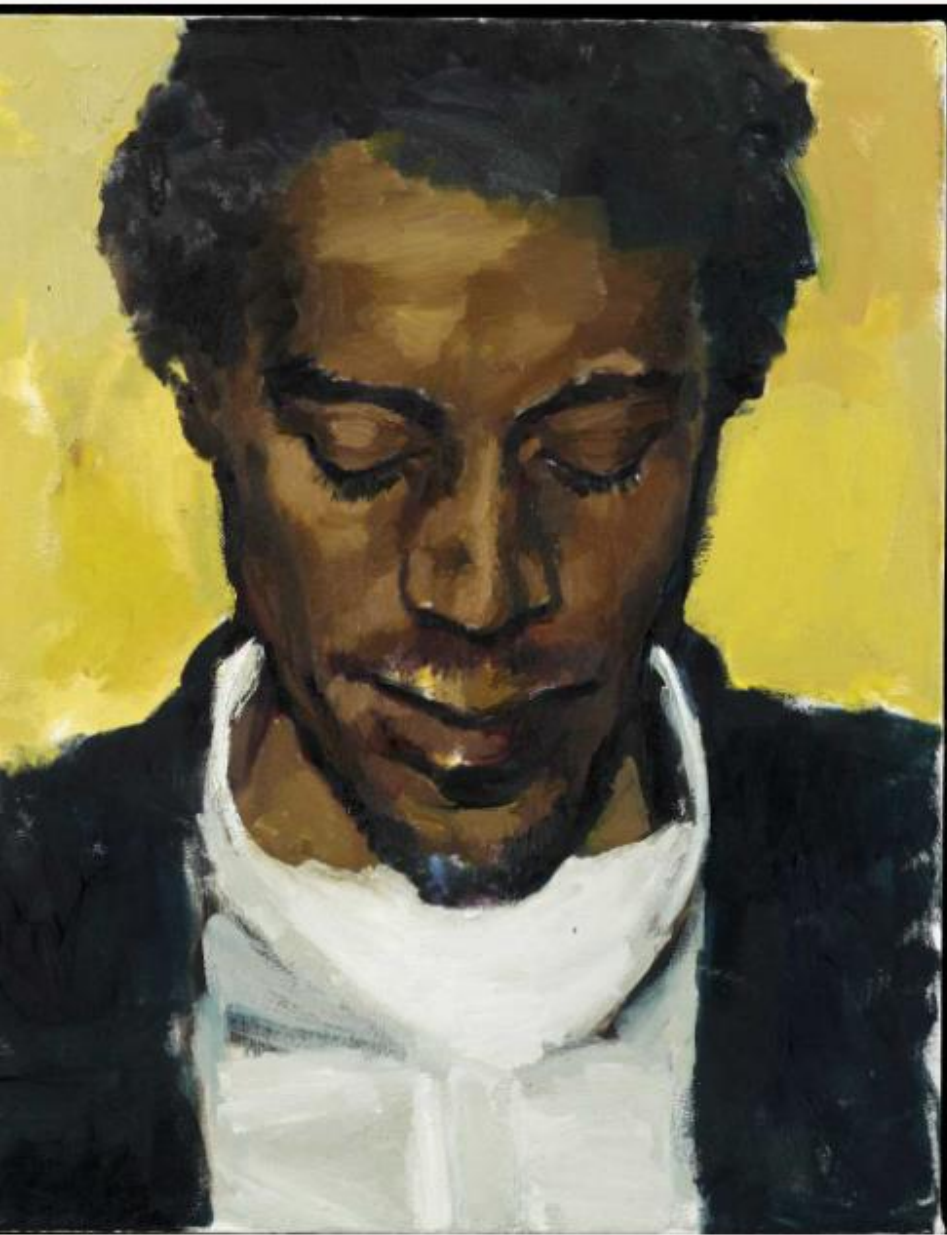
Lynette Yiadom-Boakye One by the Ounce 2014 Glen Chambers and Philippe Monrougié Lynette Yiadom-Boakye