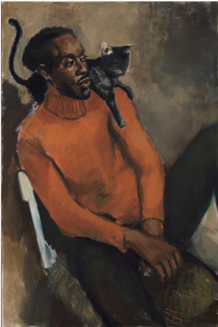
Lynette Yiadom-Boakye In Lieu Of Keen Virtue 2017